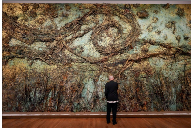
Anselm Kiefer Starry Night 2019

Kiefer did not set out to paint like Van Gogh, but he shares a love of landscape. Kiefer is fascinated by the sky and the cosmos. In Van Gogh's The Starry Night he sees the night sky as a window into a mysterious universe.