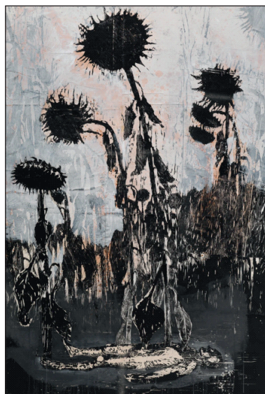
Anselm Kiefer's Sunflowers

For Kiefer, just as for Van Gogh, the sunflower symbolises the cycle of life. Both artists depict the flower in its various stages of decay. For Van Gogh, the sunflower represents his creative rebirth in Arles, where he painted them obsessively. Attracted to their eye-popping colour, Van Gogh's sunflowers radiate warmth.