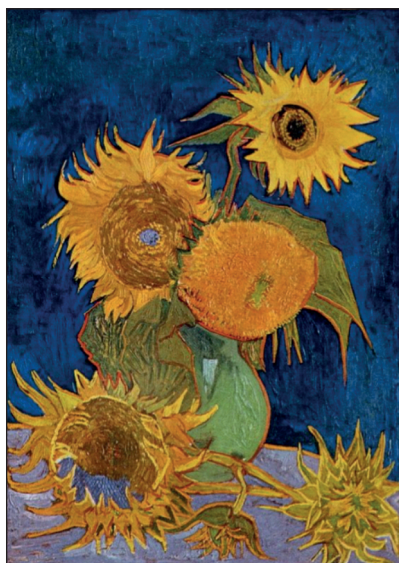
Van Gogh Sunflowers