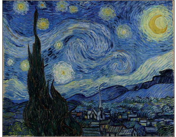
Vincent van Gogh, Starry Night 1889

The work of Van Gogh had a great impact on Anselm Kiefer. When eighteen, he retraced Van Gogh's journey from the Netherlands to Belgium, Paris, and finally to Arles where, in the final years of his life, Van Gogh created many of his most iconic works. We love the colour, the emotion and movement of Van Gogh's work. We were stunned that in just over a decade, he created approximately 2,100 artworks, including around 860 oil paintings, most of them during the last two years of his life.