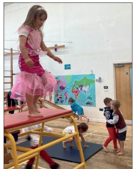
'Pirate PE' on our Key Stage One Beach-Themed Day

Now the attention turns naturally to the next academic year, which starts in early September. It is completely normal for children to feel nervous at the beginning of an academic year. What people may not be aware of is that us teachers also feel nervous. In fact, even after twenty years in teaching, and ten years in this job, I still feel those butterflies on the morning of the new school year.