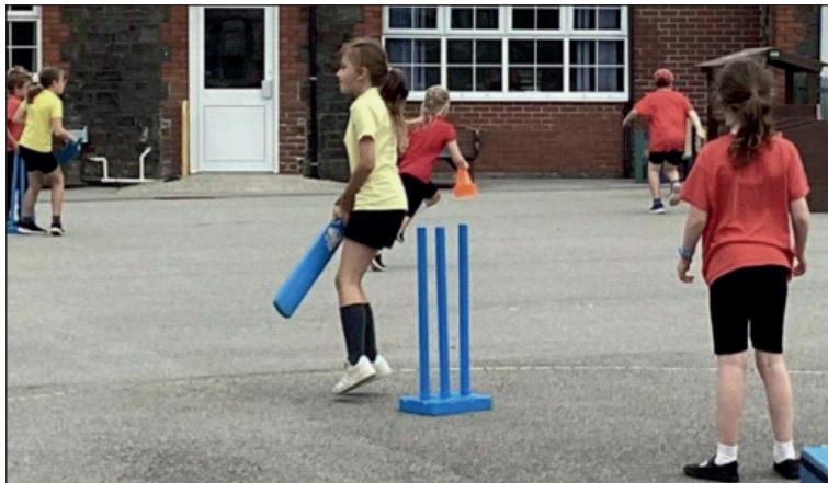
Children taking part in inter-house cricket