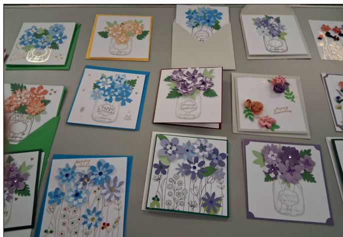
Card-making on 9 July

On 9 July, there was a good turnout as usual. Sadly our planned topic was cancelled, but Susanne stepped in at the last minute, You can see the results in the photo on the left - everyone felt pleased with their efforts and results!