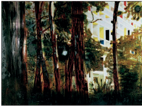
Peter Doig Concrete Cabin , 1994

We loved the contrast of light and dark, wild nature and concrete Brutalist architecture in The Concrete Cabin (above). The deep dark woods have the feeling of a fairytale.