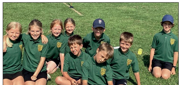
Our successful rounders teams