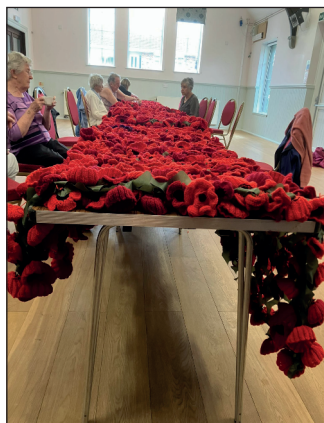
Assembling the cascade

The next poppy session is on Tuesday 16th September, 2 to 5pm, in the Grenville Rooms. All welcome to help