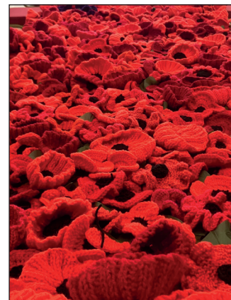
A sea of poppies!