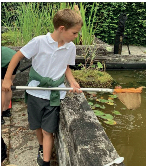
Children at RHS Rosemoor

My next article will be in the October edition, when I will be able to give you more news and pictures about what is happening in school during the new term.