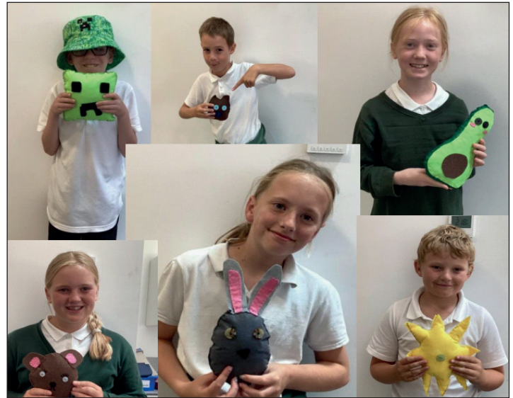
Children in Year Five with the soft toys they made in Design and Technology lessons

Although it is the beginning of a new academic year, I still wanted to be able to share some pictures with you of what happened at the end of the academic year.