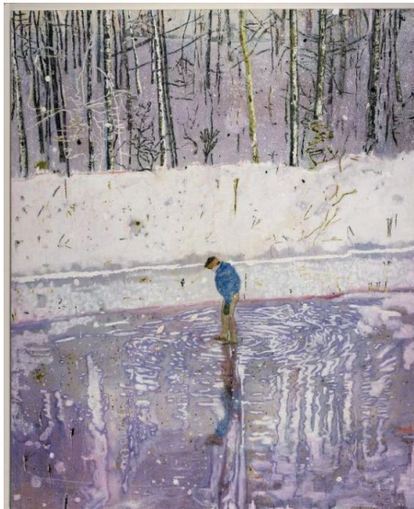
Peter Doig Blotter 1993

In 2000, Doig won a residency in Trinidad and was able to return to his childhood home. Now he has moved there with his family although he spends a lot of his time working across the world, particularly in London and New York.