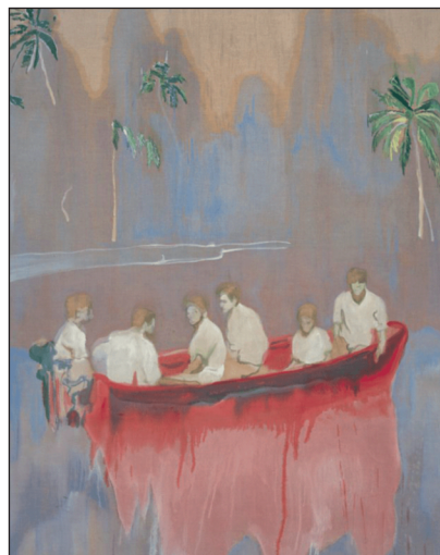
Peter Doig Figures in a Red Boat 2005-2007

When working at his studio in London. Doig's paintings were frequently inspired by memories triggered by photos of his time in Canada. In Blotter (above), a lone figure seems deep in thought in the icy wilderness.