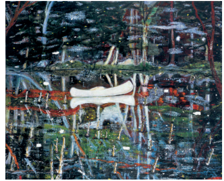
Peter Doig White Canoe 1990-91

In July, we discussed the work of Peter Doig. He was born in Scotland and grew up in Canada and Trinidad. He returned to the UK to study art and achieved his MA in 1986. The quality of his work was immediately recognised in his first exhibition at the Whitechapel Gallery in London. Doig sold White Canoe for £1,000 and it was auctioned at Sotheby's for $11.7 million in 2007 making him the most expensive artist at that time. We loved the dazzling light in this painting and its sense of mystery. Like most of his work, there is so much to look at and puzzle over.