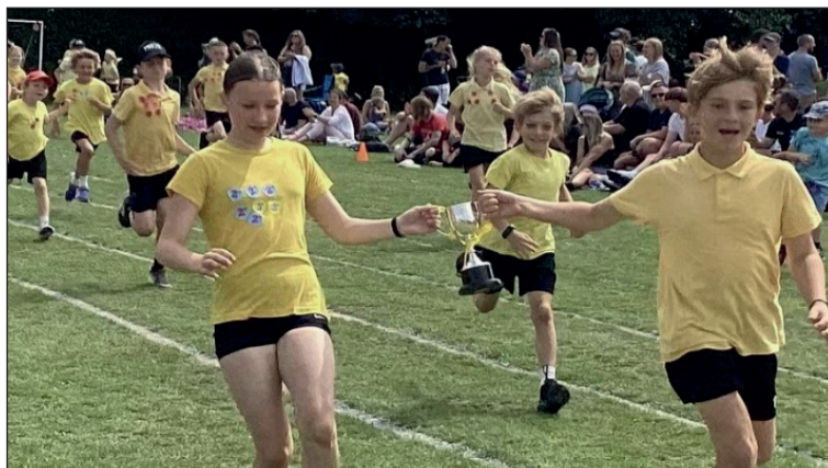
Hawker house (yellow) celebrating winning sports day

We have had lots going on in school in the last few weeks of term: trips to Bridge Mill and RHS Rosemoor, our summer fair and sports day, as well as taster days for the Year Sixes at their new schools.