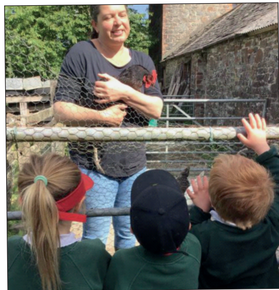
Children from Sandymouth class meeting the chickens at Bridge Mill