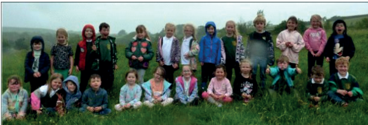
Children from Northcott class in the meadow at Bridge Mill