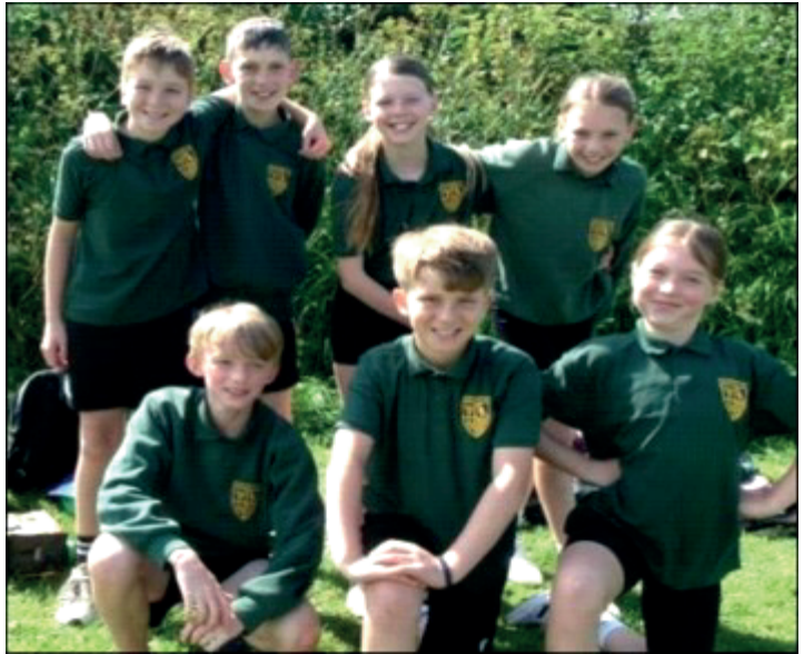
Members of our Quad Kids athletics team who came second at Budehaven in the recent competition

We have already had school trips for Reception, Year One and Year Two, visiting Bridge Mill, near Bridgerule. Whilst there, the children got to do pond dipping, see and feed the farm animals and go for an exciting adventure through the long grass of the meadow. Our eldest children have also been able to take part in cycling proficiency. Next week the children in Year Five and Six will take part in a residential at Beam House near Torrington; for many children this will be their first stay away from home without their families.