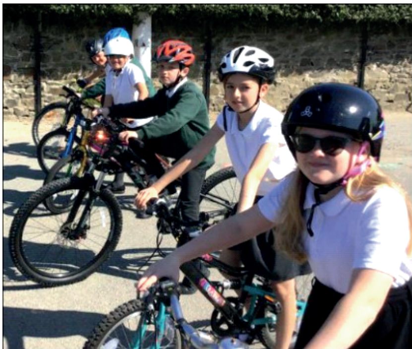
Children taking part in cycling proficiency training

We may be down to the last month of term but the children have still so much to look forward to. We have inter-house cricket and rounders, our sports day and school fair. We also have a visit from Really Wild Learning, where children will be able to view exotic animals in school! We are taking part in the Hall for Cornwall's outreach programme in early July where the children can experience live theatre on the playground! We will also be taking advantage of Bude Sea Pool to offer 'Swim Safe' workshops to our confident swimmers.