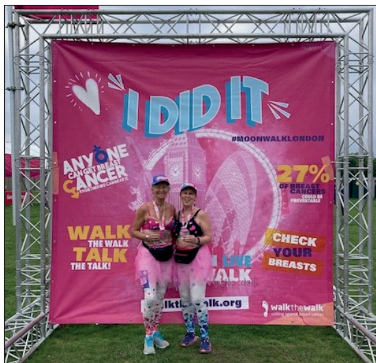
The celebratory pose for the camera!

Eventually at 11.15 we started our walk, leaving Clapham Common through the pink inflatable arch. It was so exciting to actually be on our way. The start of the journey was amazing, with some iconic buildings lit up in pink for the night. To about mile 14 we were doing ok, then it was a long drag around Hyde Park, too dark to go through sadly, but thankfully we were over halfway. After passing the Albert Hall the next part of the walk was mainly through quieter streets and not as many landmarks to see, which made it a very hard part of the walk. Luckily the cheery volunteers guided us across the roads safely and directed us along the route, plus all the walkers were encouraging others, which helped us to plod on. The next big milestone for us was the 20 mile marker – it was great to see it. With the break of day and the birds singing, we made our way back to Clapham Common to the finish line and to collect that all-important medal. Our finish time was 7.23am, oh what a night and such an amazing experience.