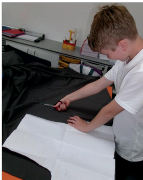
A Year Six pupil making a waistcoat they have designed