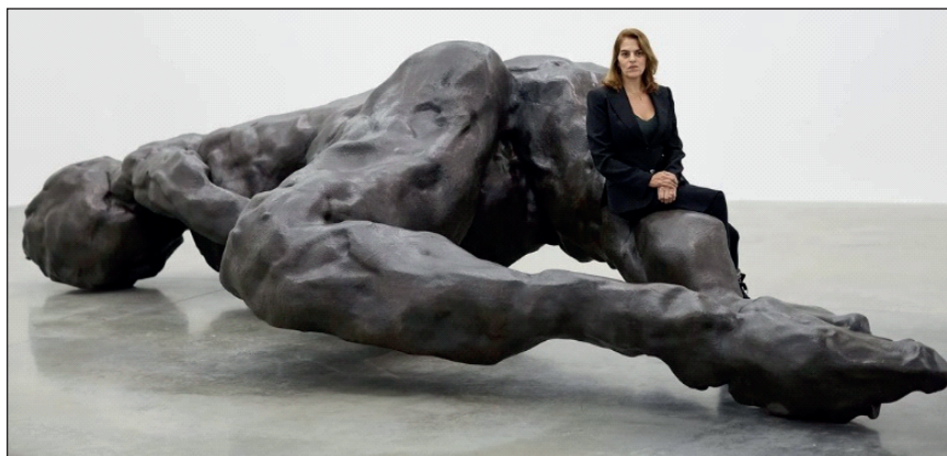
Tracey Emin with her sculpture: 'I Lay Here For You', 2022

Everyone in the group remembered when Emin was nominated for the Turner prize with My Bed , but we had not recognised its significance. It was an expression of the disgust Emin felt when she woke from a complete breakdown and saw the state that her life had become. It represented a turning point in her life.