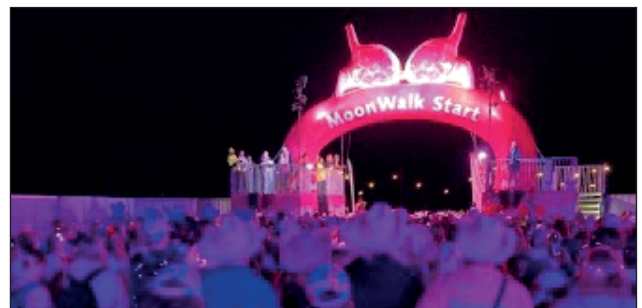
Crowds waiting to set off at the start

The event was attended by nearly 5000 walkers, plus there were so many volunteers!