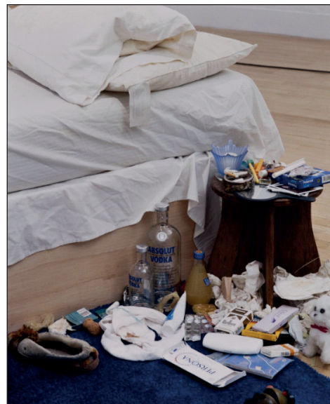
Part of 'My Bed', 1999, Tracey Emin

Emin has experienced many tough times including cancer and insomnia, and she pours her emotions into her art and hopes that many will identify with her work. She is now Professor of Drawing at the Royal Academy and lectures all over the world. She works across media including needlework and sculpture, drawing, video and installation, photography, and painting.