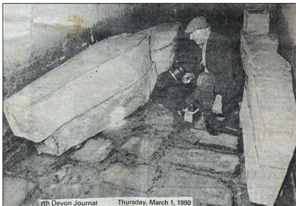
Photograph of vault with 6 average-sized coffins and one small cube - top right of photograph

The matter was widely publicised in the local press, and a summary of part of an article in the North Devon Journal is on this page. The ‘mystery’ is the small lead ‘coffin’, which still lies in the resealed vault.