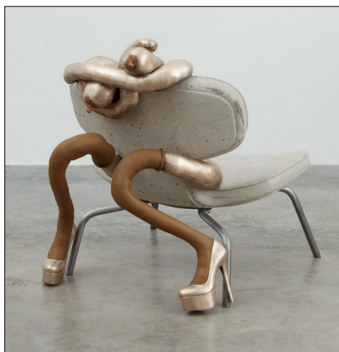
'Oops', 2019, Sarah Lucas

Sarah Lucas uses ordinary objects in unexpected ways. She particularly likes stuffing tights to create sculptures that challenge attitudes to class, gender and stereotypes. She breaks boundaries with satirical humour and daring.