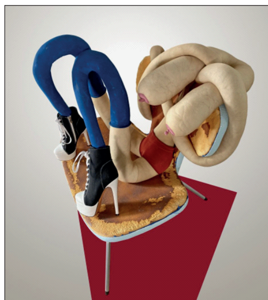
'Cool Chick Baby', 2021, Sarah Lucas

Sarah now exhibits in National Galleries all over the world. Lucas made her early work from cheap materials that she found, but nowadays the chairs on which the figures sit are custom made, and her sculptures could be cast in bronze.