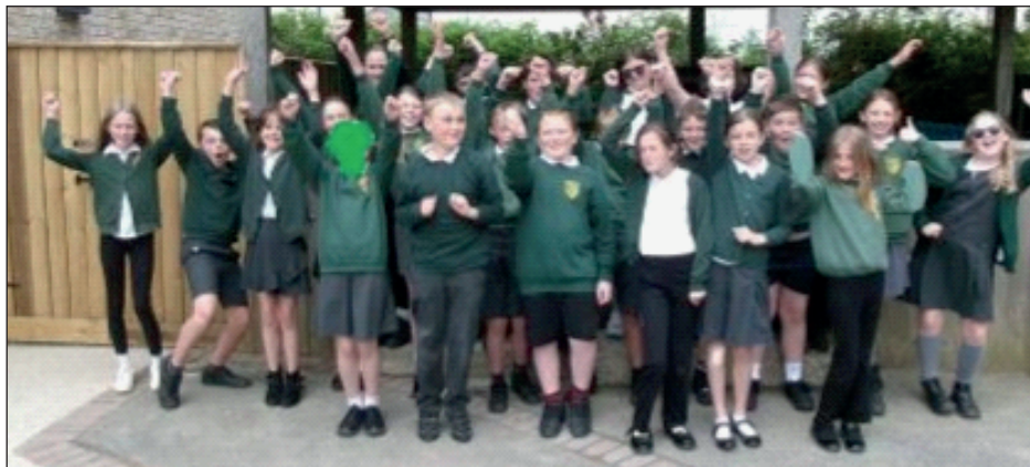
Year Six celebrating the end of their SATs tests

I am writing this article in mid-May, with sun streaming in through the office windows. It has been a long and wet winter but it is nice to finally see some sunshine. As a result, the children have again been able to use the school field and sports have moved away from rugby and football towards athletics, rounders, crickets and tennis.