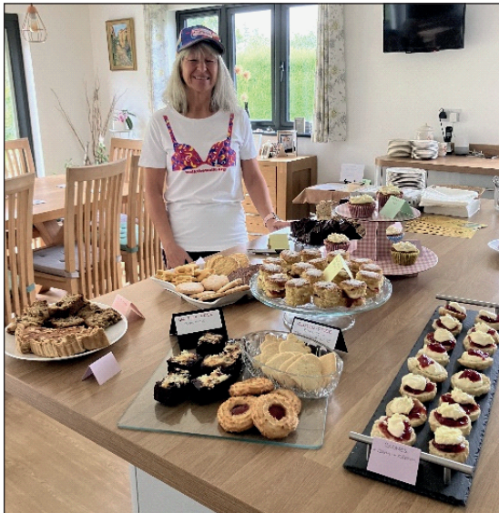
Just a sample of the cakes and biscuits on offer at the fundraiser - they were all amazing!