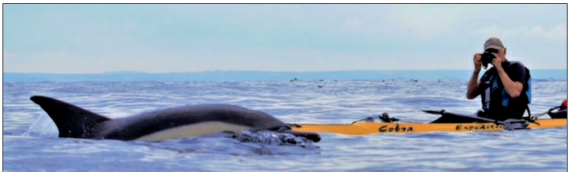
Left: Kayak and dolphin