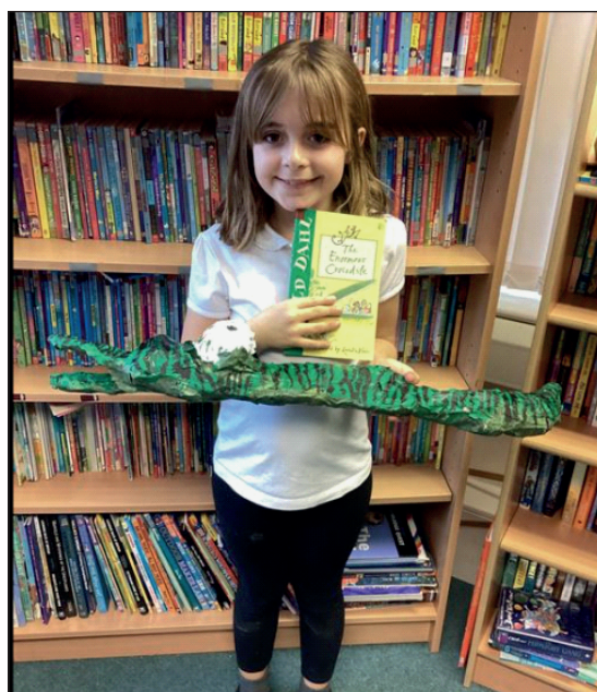
Emilie also made 'The Enormous Crocodile'