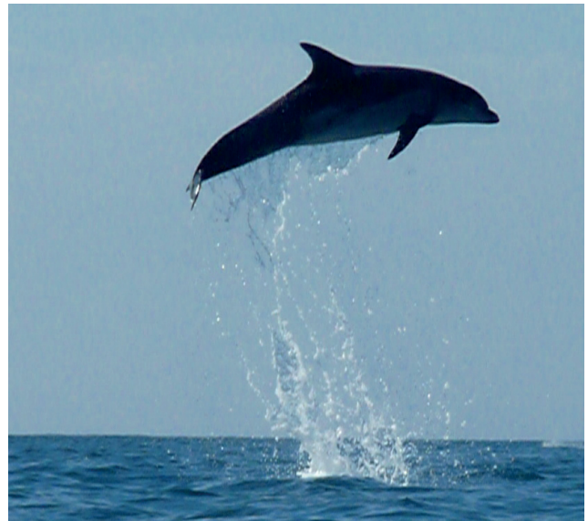
Dave the dolphin, taken at Coombe Martin