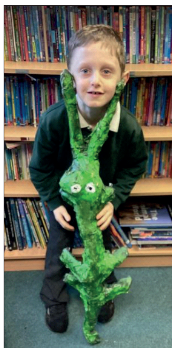
Finley's 'Enormous Crocodile' really was enormous!