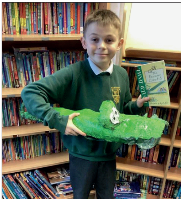
Harry made 'The Enormous Crocodile'