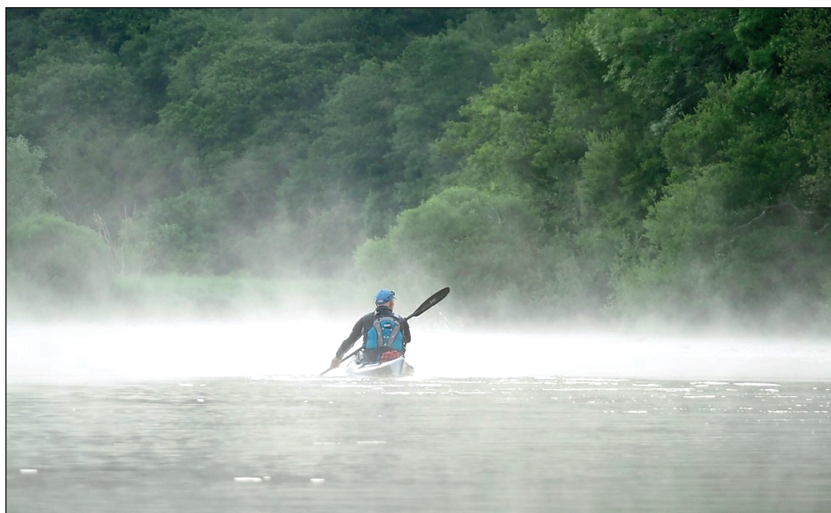
Kayaking up the Tamar river in fog