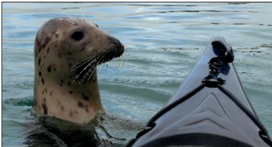
A friendly seal