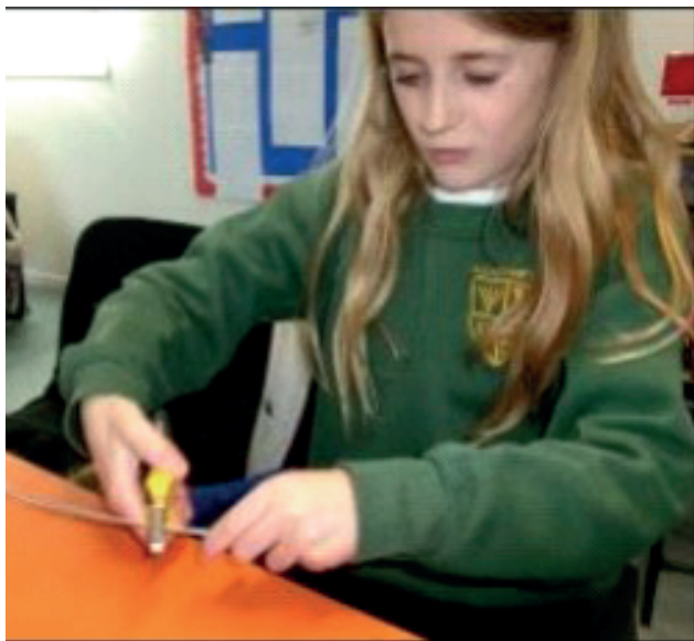
Year Six Created 'Steady Hand Toys'