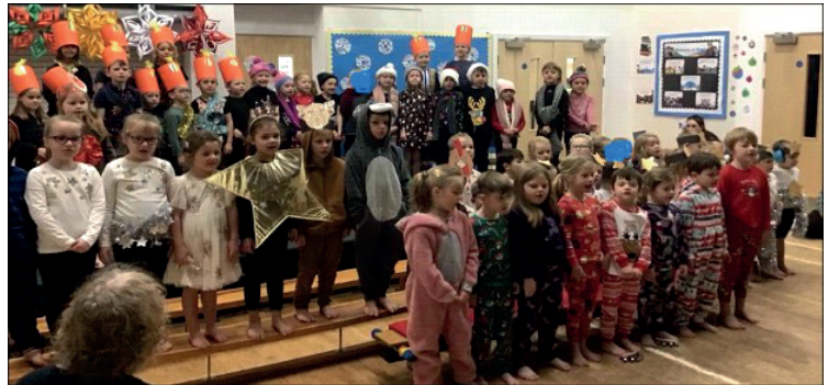
Key Stage One performing 'Robin's Christmas Singalong'

A lot has happened since I last wrote to you including our Christmas plays, which we performed in the school hall. Due to having to use the hall rather than Penstowe, we staged separate Key Stage One and Two performances for the first time and these were held over several days to ensure that all parents could come and see their children perform. Children and staff alike worked hard on the shows and the children were superb in their performances.