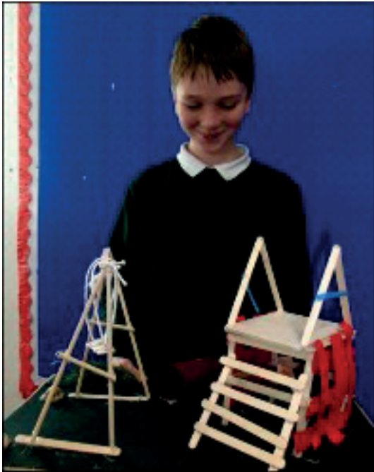
Children in Year Six designed playgrounds in Design and Technology