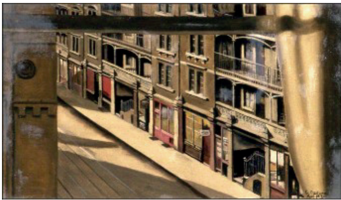
Cecil Osborne: Sunday Morning Farrington Road, 1929