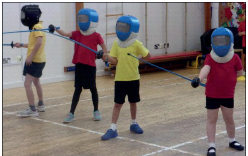
Children in Year Two enjoying a fencing session