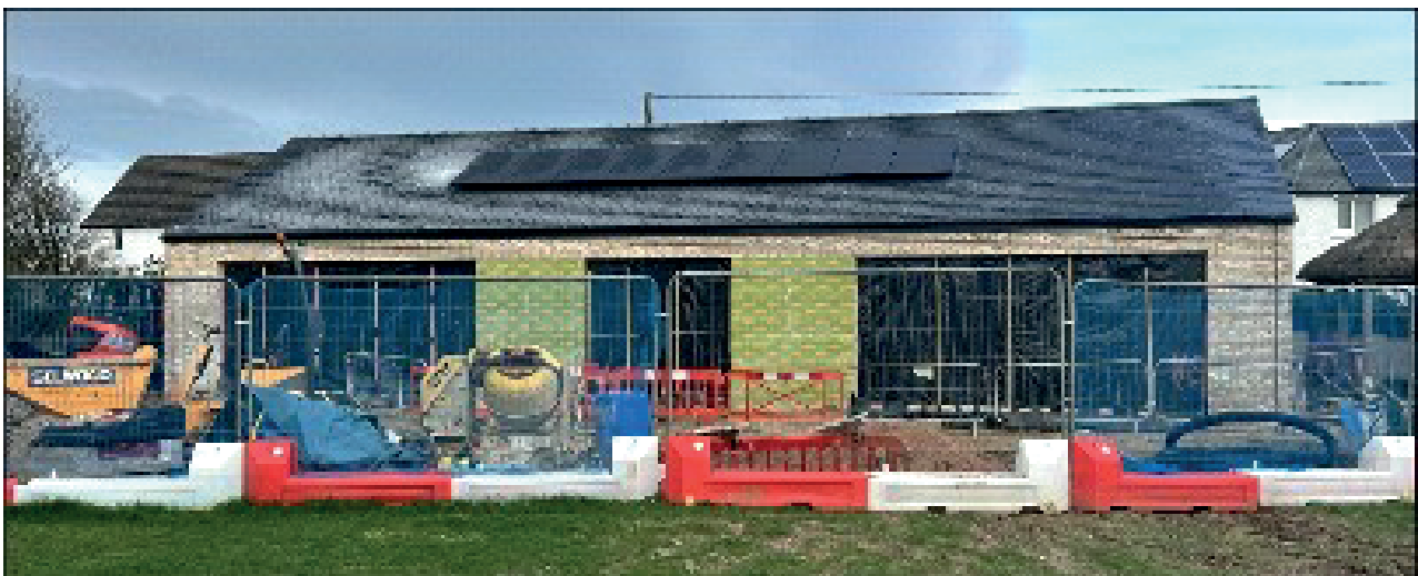
The current view of the new classroom block

We have seen a lot of progress in the new building over the last few weeks. The brickwork and slates on the exterior of the building have been completed, with solar panels now fitted. The building is now watertight and work is now happening mainly on the interior. At my last building inspection, insulation had been fitted, as had the underfloor heating, and the scree work on the flooring was being installed. There have been some delays to completion due to the adverse weather conditions, but we are anticipating moving the classes in some time around Easter with the Portakabin being removed at the same time.