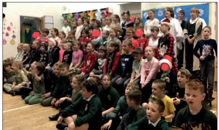
Key Stage Two performing 'A Christmas Carol: Reloaded'

We have seen a lot of progress in the new building over the last few weeks. The brickwork and slates on the exterior of the building have been completed, with solar panels now fitted. The building is now watertight and work is now happening mainly on the interior. At my last building inspection, insulation had been fitted, as had the underfloor heating, and the scree work on the flooring was being installed. There have been some delays to completion due to the adverse weather conditions, but we are anticipating moving the classes in some time around Easter with the Portakabin being removed at the same time.