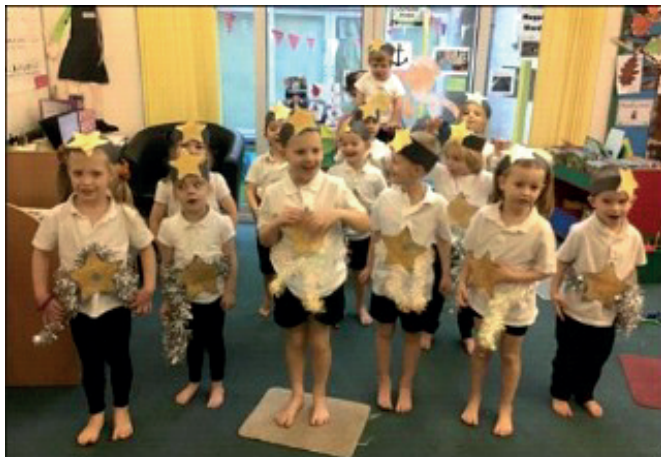
Children in Reception class ready for their performance