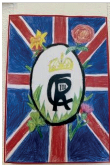
Left: One of the royal ciphers produced by Summerleaze class