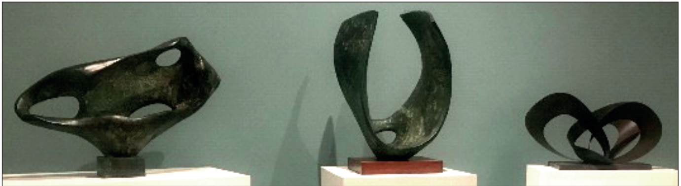
Above: Barbara Hepworth's sculptures

Many of us are familiar with the sculptures in Hepworth's garden but this time we saw works borrowed from other parts of the country. We all wished that we could run our hands over the curves and textures in the way that Hepworth felt was so important. Sad that for the sake of conserving her work her wishes cannot be followed.