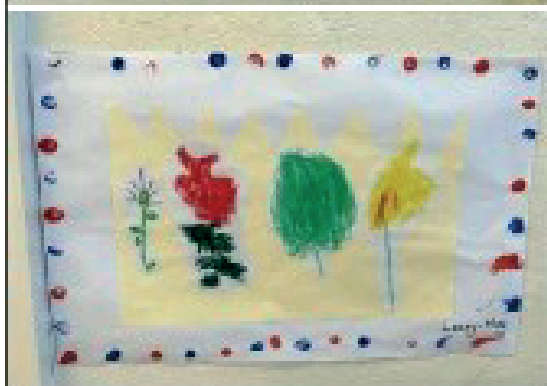
Crowns with national flowers produced by Sandymouth class