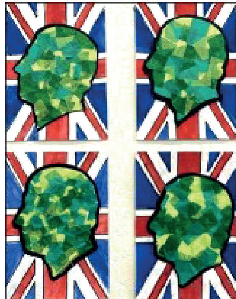
Collage silhouettes of the king by Widemouth class