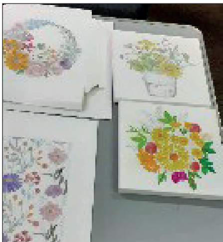
Below: completed canvases