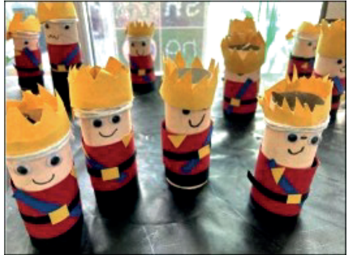
Miniature King Charles produced by Northcott class