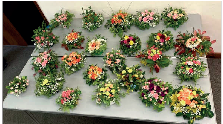
Above: Spring flower table arrangements