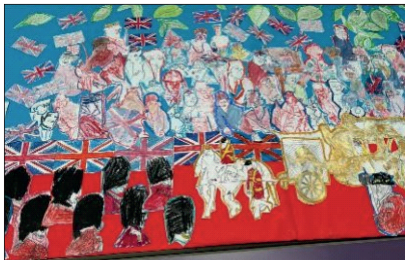
Above: Coronation procession by Crooklets class