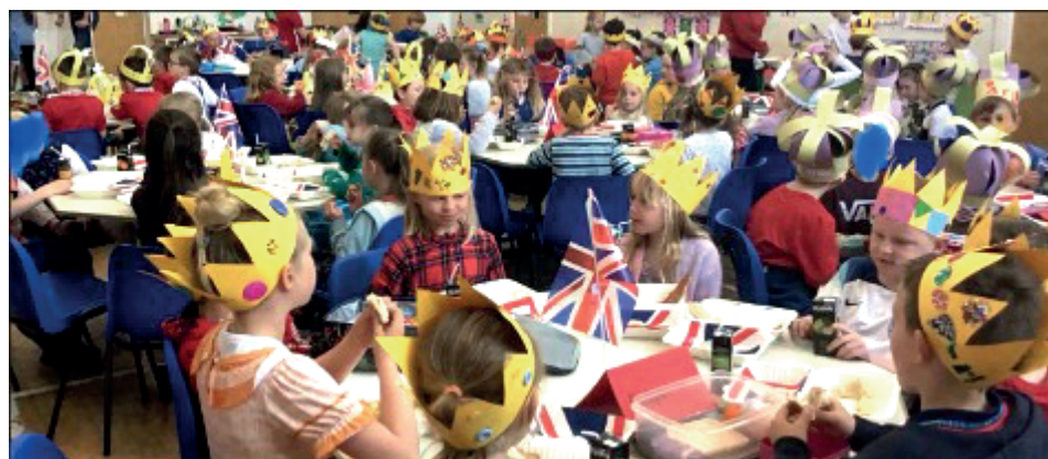
Right: Children enjoying their 'street party'