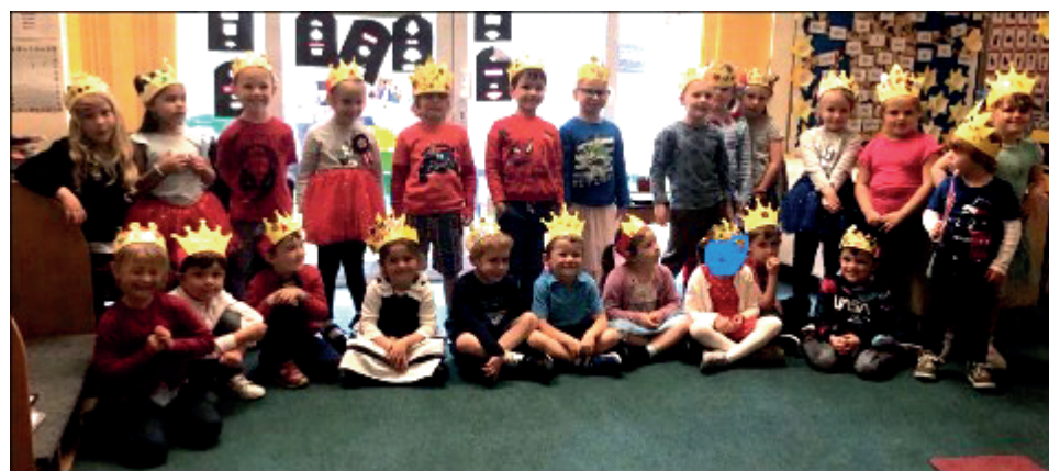
Left: Sandymouth class wearing the crowns they made