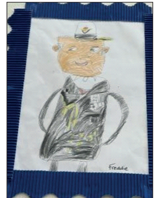
Portraits of King Charles III by Duckpool class