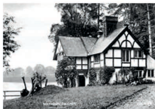
Old Boathouse at Colemere