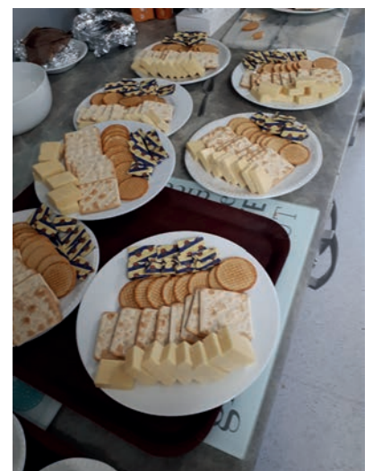
Cheese and biscuits to finish with a cup of tea or coffee