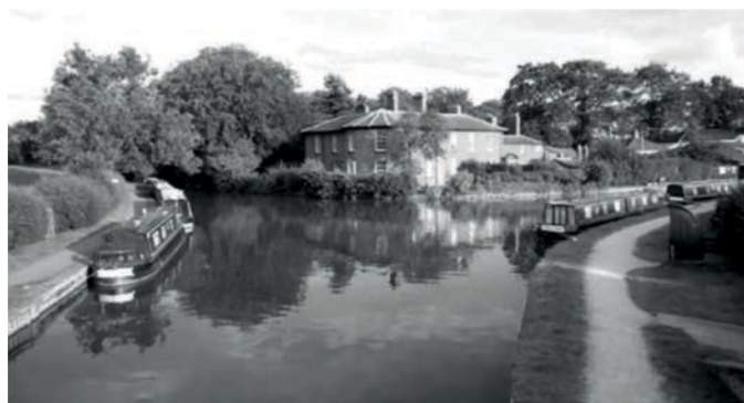
Junction at Ellesmere to Crewe and to Llangollen

So, as you can see, we are strangers in a strange land and preoccupied by the complexities of being homeless and in-between but next time I hope to be able to tell you about this new (to us) diverse and wildlife rich area as it wakes up in early Spring and reveals its true nature. Ian Maddock. ismaddock@btinternet.com