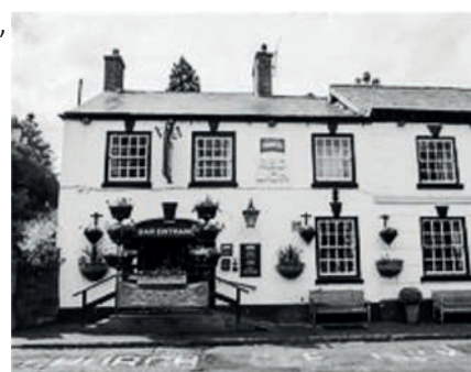
The Red Lion Inn Ellesmere

In the heart of this small, medieval market town and a legacy of the Industrial Revolution, lies a dead end spur of a canal and half a mile along the towpath, a bridge and then a Y junction. This is the work of Thomas Telford, the greatest and most skilled of all canal builders. The left arm weaves its way from Ellesmere, through tunnels, around several meres, between hills and on raised banks, past the mosses at Whixall and the old and discontinued Prees branch. The canal continues by Whitchurch, the Willey Moor locks, the lift bridges at Wrenbury and finally to Hurlston Junction on the mighty Shropshire Union Canal. This canal travels north to its end at Ellesmere Port on the Wirral and south to Autherley Junction near Wolverhampton to join the Staffordshire and Worcestershire Canal. The right arm from Ellesmere turns west and north to Llangollen, eventually crossing Thomas Telford's famous and breathtaking Pontcysyllte Aqueduct near Trevor and beyond into the Vale of Llangollen.