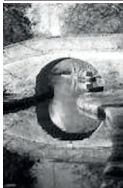
Canal Bridge Ellesmere

Ellesmere....Shropshire's Lake District! Pushing the boat out a bit that one but certainly a place of canals and lakes. Hopefully, by the time this hijacks the March issue of the Kilk News, we may have moved into our new home in Ellesmere, truly a place of gentle hills, tranquil lakes and busy canals. Edmund Vale wrote of Ellesmere in 1949 in a County Books edition "On the bare bosoms of these reflecting and reflective waters are many varied and visiting waterfowl and its inevitable, nobility of swans." Today the meres teem with water birds and the mosses still beautiful and dotted with dwarf birches, in Autumn their leaves are of spangled gold. This unusual landscape, also found in Cheshire, was formed by the melting of the ice sheet 10,000 to 12,000 years ago, the deeper 'kettle' basins becoming meres and the shallower depressions filling with plant matter to form the mosses which were essentially peat bogs, exploited in the centuries following. These features are not fed by fast flowing mountain streams as in the Cumbrian lakes but maintain an equilibrium from rainwater, groundwater and evaporation, the mosses and meres in perfect balance.