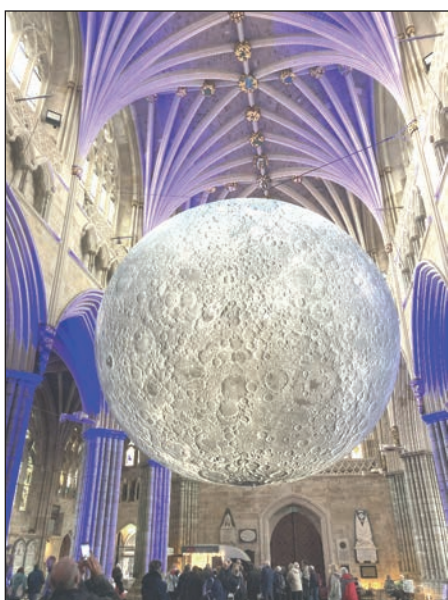
Model of the moon in Exeter cathedral

I thought you might be interested in the photo (below) I took on a recent visit to Exeter Cathedral - a model of the moon inside the cathedral itself! It was an exhibition entitled 'Museum of the Moon', on from 3 rd to 27 th February so only a couple of days left when this newsletter comes out. I'm not quite sure what the moon was made of, possibly paper or some other light material as it was suspended from the ceiling and swaying gently in the breeze!