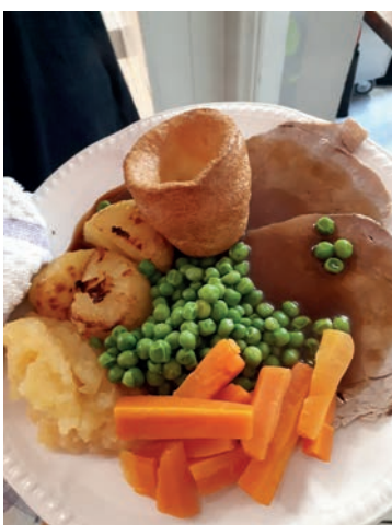
Roast beef platter