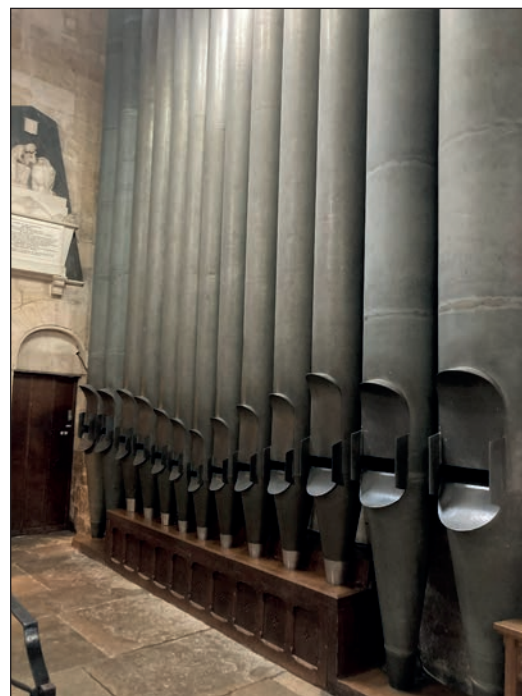
Organ pipes in Exeter cathedral