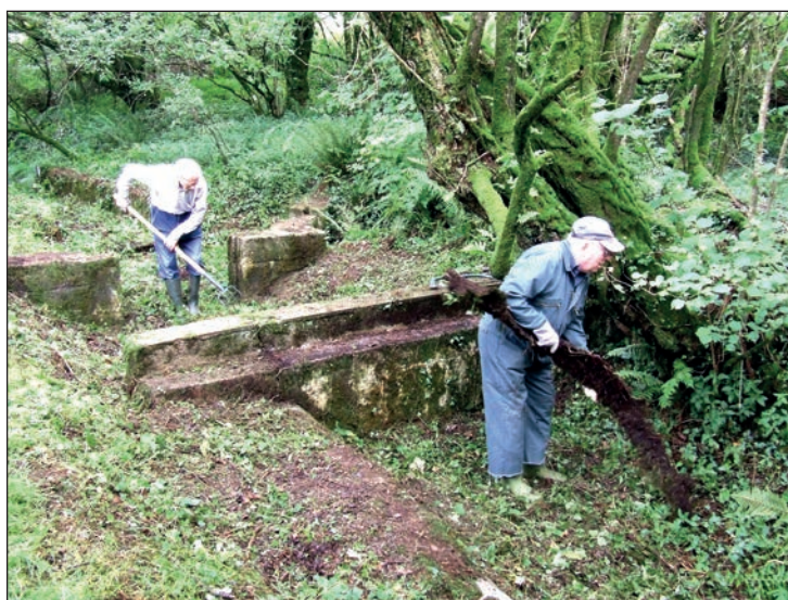
Above: tree root removal from wall