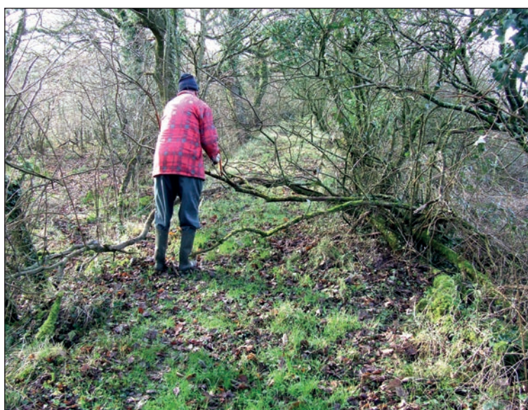
Above: light clearing done

There is always plenty to keep us busy and the more helpers we have the better. Most of the work is clearing and burning the cut material.