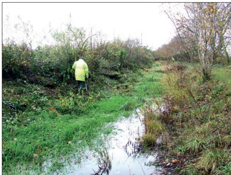
Above: start of week

The Bude Canal Trust is a small, local charity that owns and maintains the Bude Aqueduct, a five-mile long stretch of the old feeder canal that runs from Lower Tamar Lake down to the River Tamar. The canal is accessible from several points and a well-maintained path that is open to the public runs the full length of the canal. The charity's aims are to retain the historic interest of the old canal while managing what has become an important wildlife area. The trust is the major single landowner of the canal, and exists to retain and enhance the historic interest of its length and to manage it appropriately for its wildlife importance and low-key recreation potential.